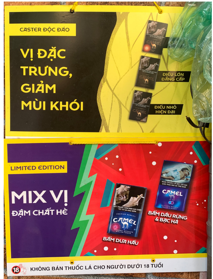
Advertisement signage for cigarettes outside a retailer in Ha Noi.

An observational study in urban and rural areas of ten Vietnamese cities (Ho Chi Minh City, Ha Noi, Da Nang, Hai Pho, Can Tho, Ha Tinh, Cam Pha, Tay Ninh, Hoa Binh, Buon Ho) assessed compliance with legislation and monitored the sale of cigarettes, e-cigarettes, and HTPs. From December 2021 to January 2022, all retailers (n=1470) within 100 meters of a school (n=371) or post office (n= 325) were observed for product displays, advertisements, and promotions.