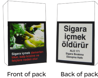
Front of pack