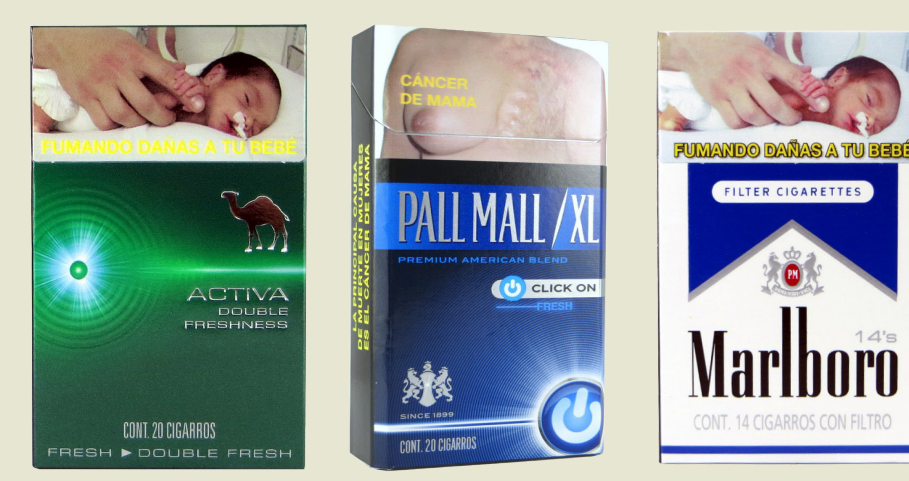
Sufficiently visible text warning with black outlining

Also, the flavor capsule imagery can draw attention away from the HWL.