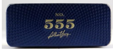
Image 3. Round edges