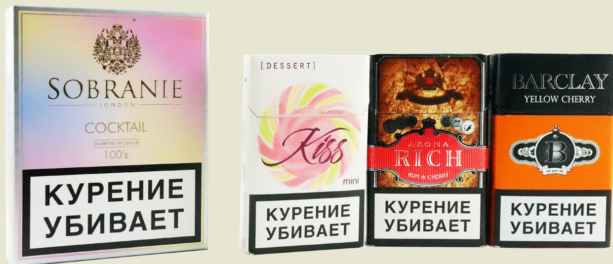
Flavors above include (from left to right): COCKTAIL, DESSERT, RUM & CHERRY AND YELLOW CHERRY

These packs demonstrate the range of flavored cigarettes available. Seventeen percent of all packs collected in the Russian Federation contained a text or visual reference to flavor.