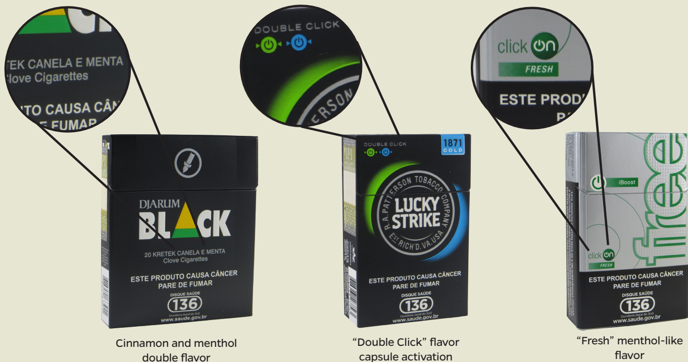
Cinnamon and menthol double flavor

Although compliant with the four key HWL requirements, these three packs exhibit some of the common flavor appeals found among the unique packs collected in Brazil: use of double flavors, flavor capsule activation, and “menthol like” descriptors.